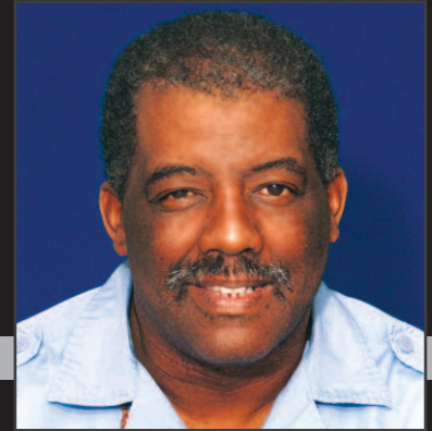
BY ALVIN WILLIAMS